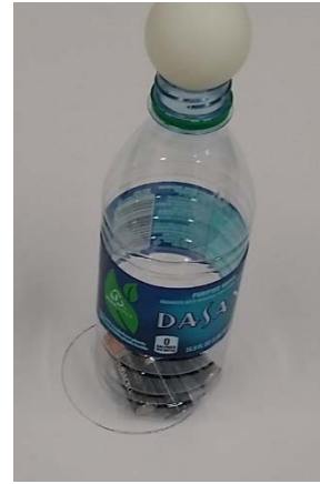
Figure 6. Obvious out