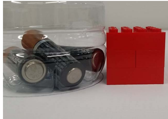
Figure 8. The bottle does not remain inside circle

Notice that the side of the bottle is wider than the bottom of the bottle, so the edge of the cube must touch the side of the bottle AND the circle for the bottle to be considered "in".