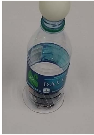
Figure 5. Initial Setup