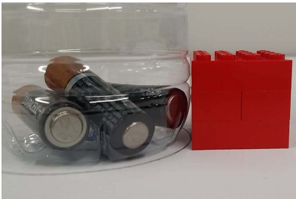
Figure 7. The bottle remains inside circle